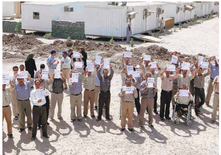
MEK residents at Camp Liberty in Iraq

matter what, the safety and security of the MEK members at Camp Liberty must continue to be a priority. For that, we stand in solidarity today.