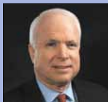
Sen. John McCain