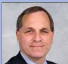
Louis J. Freeh