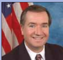
Rep. Ed Royce